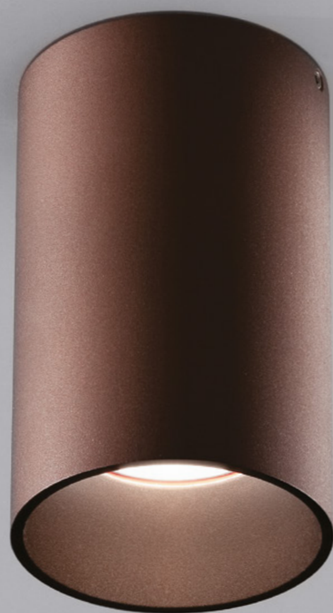
OKKIO 55 CL