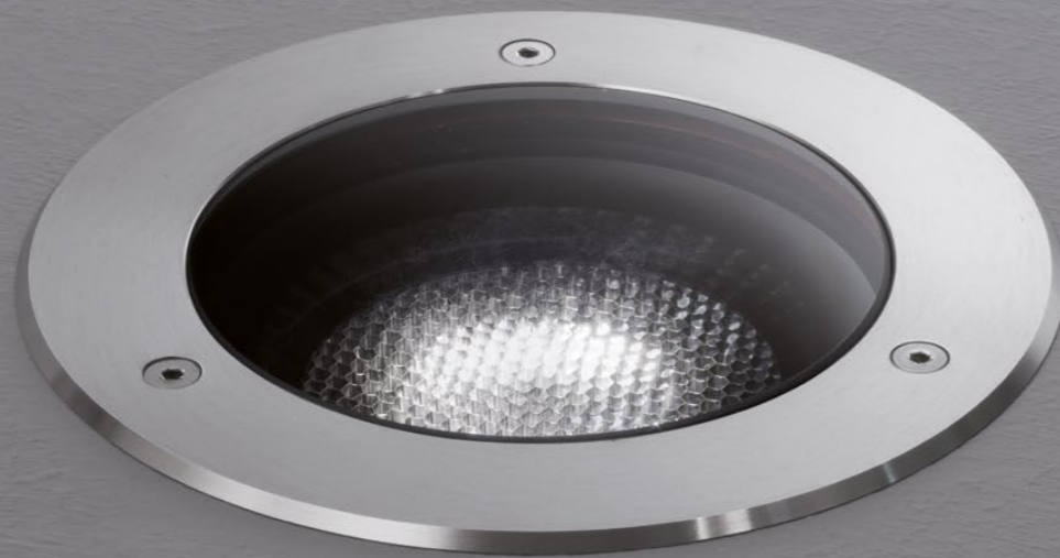
MEROPE 140 - PROTRUDING FACEPLATE