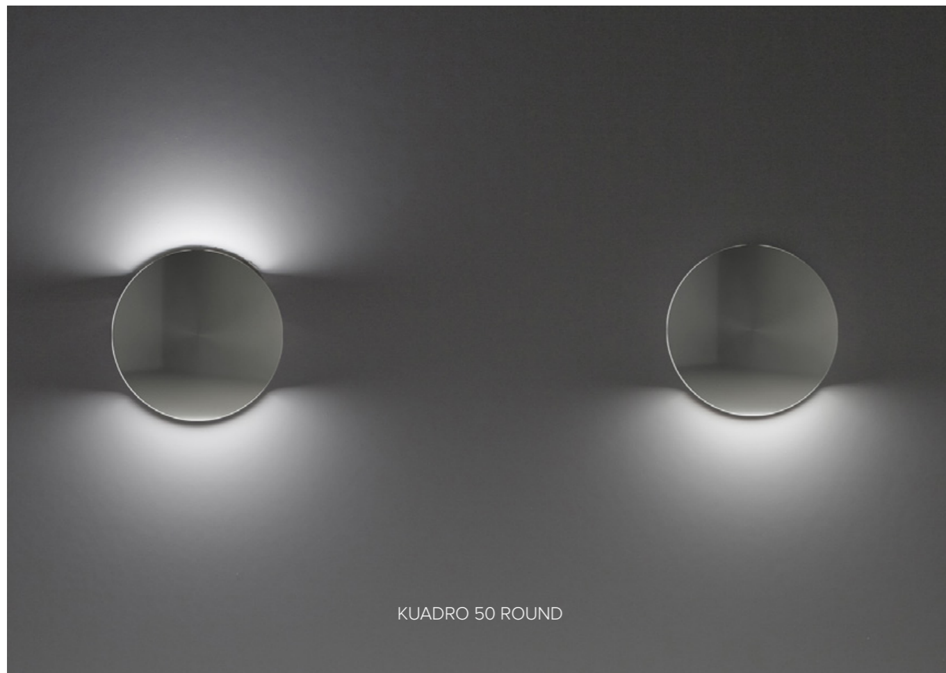
KUADRO 50 ROUND