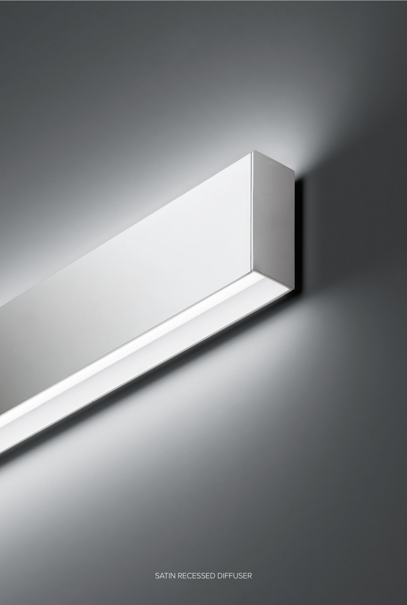
SATIN RECESSED DIFFUSER