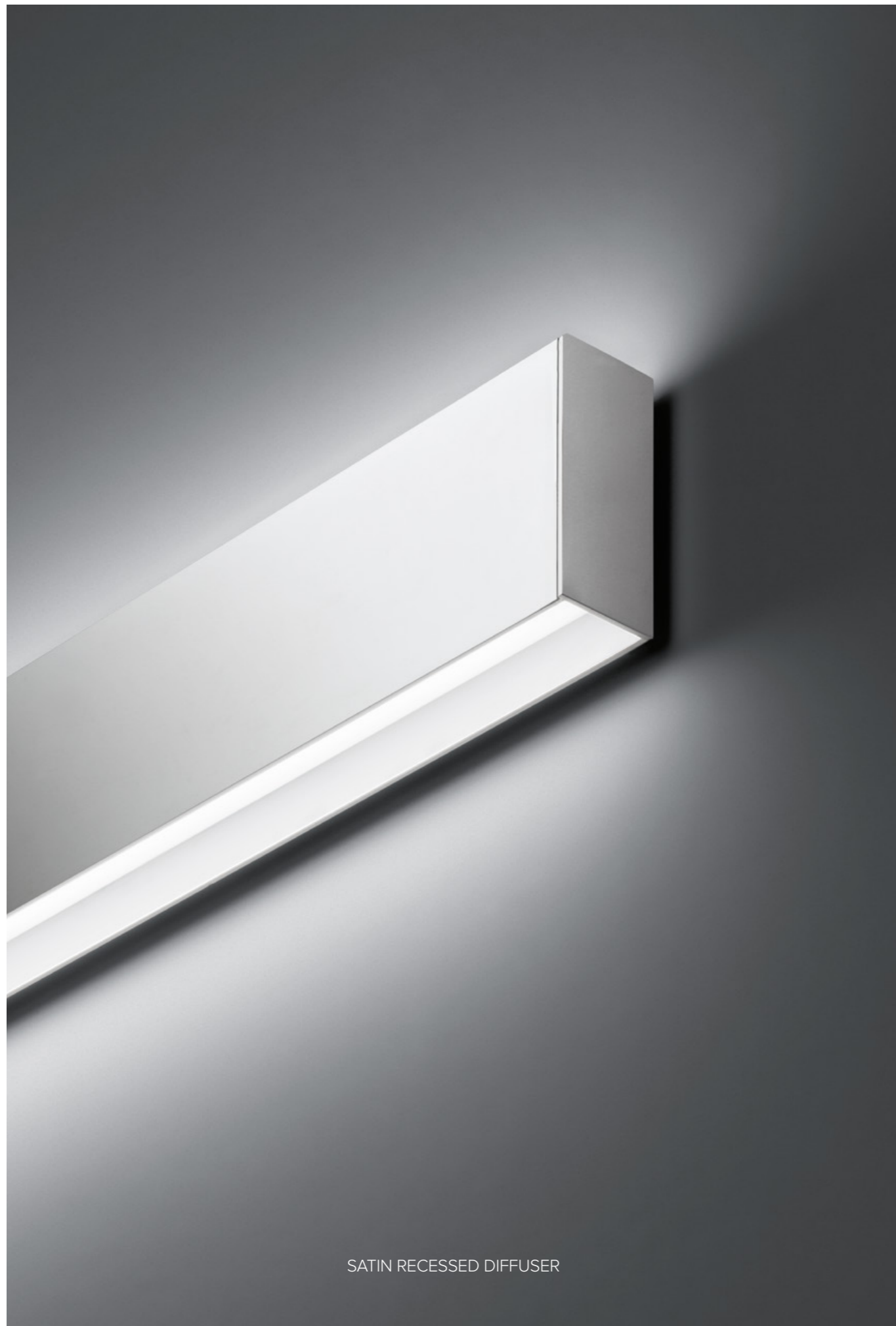
SATIN RECESSED DIFFUSER